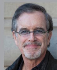
Garry Trudeau April 18, 2023