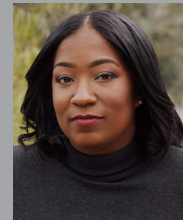
Brit Bennett September 13, 2022