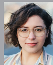
Casey McQuiston November 15, 2022