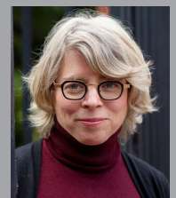
Jill Lepore May 9, 2023