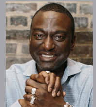
Yusef Salaam October 11, 2022