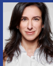
Jodi Kantor April 14, 2026