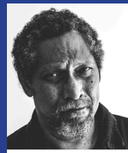
Percival Everett October 20, 2025