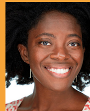
Yaa Gyasi November 9, 2021