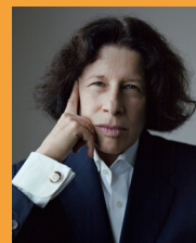
Fran Lebowitz April 19, 2022