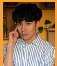
Ocean Vuong May 17, 2022