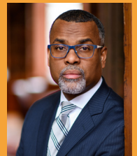
Dr. Eddie Glaude, Jr. March 9, 2022