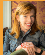
Susan Orlean September 14, 2021