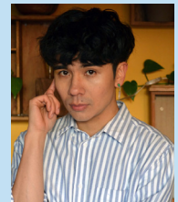
Ocean Vuong May 17, 2022