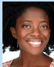
Yaa Gyasi November 9, 2021