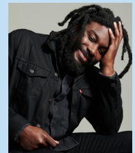
Jason Reynolds October 26, 2021