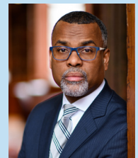
Dr. Eddie Glaude, Jr. March 9, 2022