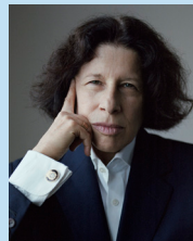
Fran Lebowitz April 19, 2022