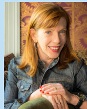
Susan Orlean September 14, 2021

John H. Mulroy Civic Center • Syracuse, NY